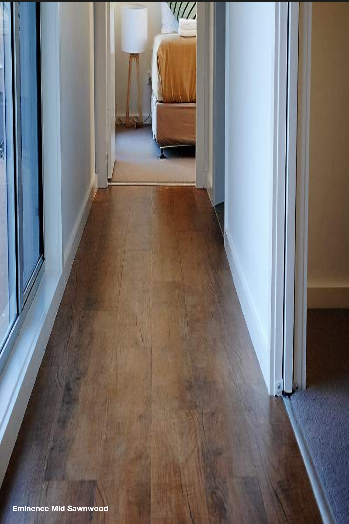
Eminence Mid Sawnwood